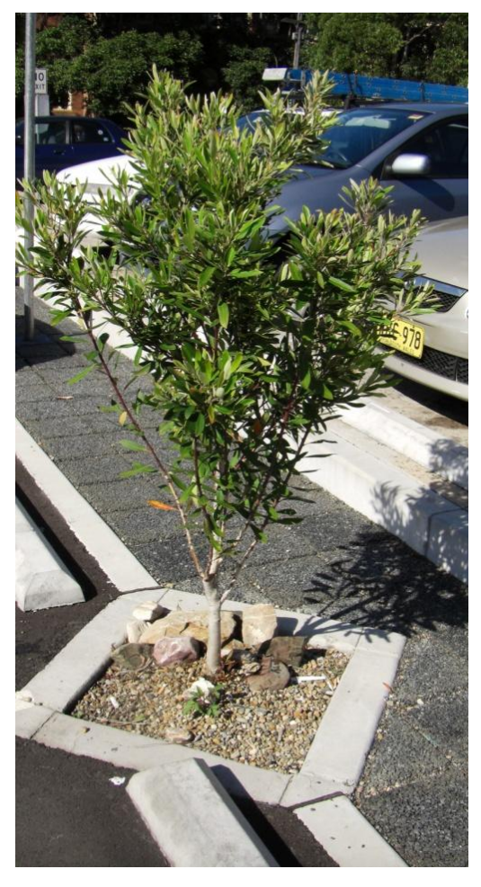
Plate 2. Examples of potential elements for the development